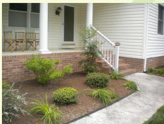
Here's a freshly mulched landscape bed ready for winter.

* Does your garden need mulch to keep plant material protected this winter? A thin layer of additional mulch to topdress landscape beds may be necessary this fall. Mulch helps to conserve moisture in the soil as well as to prevent weed growth. It also provides a more even (warmer) temperature for plant material as the ground freezes. Often, the ground heaves as it freezes and thaws, forcing the root systems of many plants up from the soil and exposing them. Mulch helps prevent this from happening.