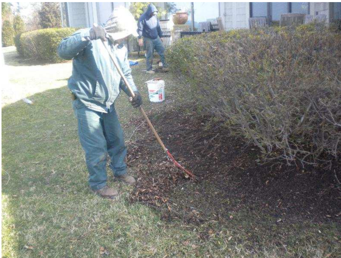
Cleaning the winter debris from a landscape bed.

Here's a project we completed this past winter. Be sure to check out both the "before" and "after" pictures.