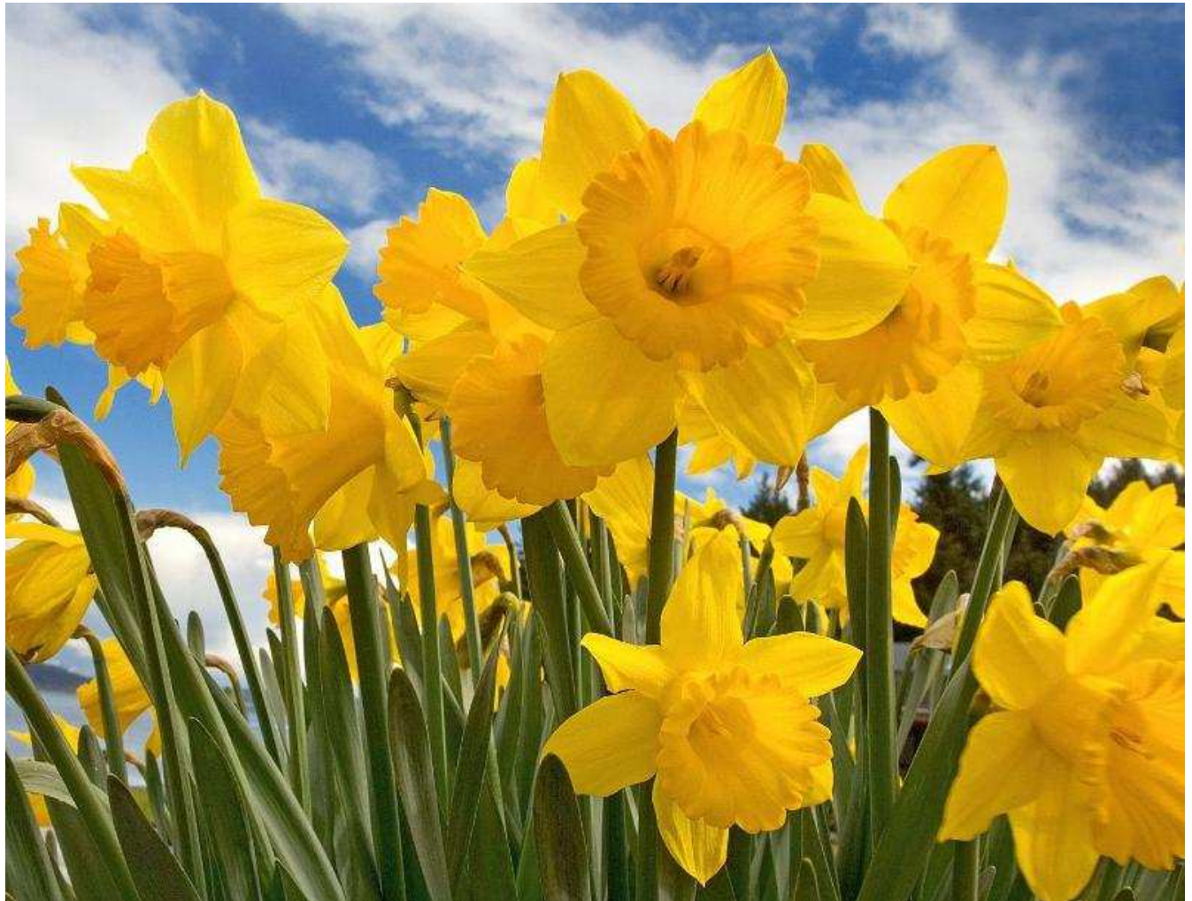
The photographer was laying on the ground, looking up, when she took this picture.

* If you want to enjoy spring flowering bulbs, they need to be planted this fall. Remember how beautiful those spring daffodils look?